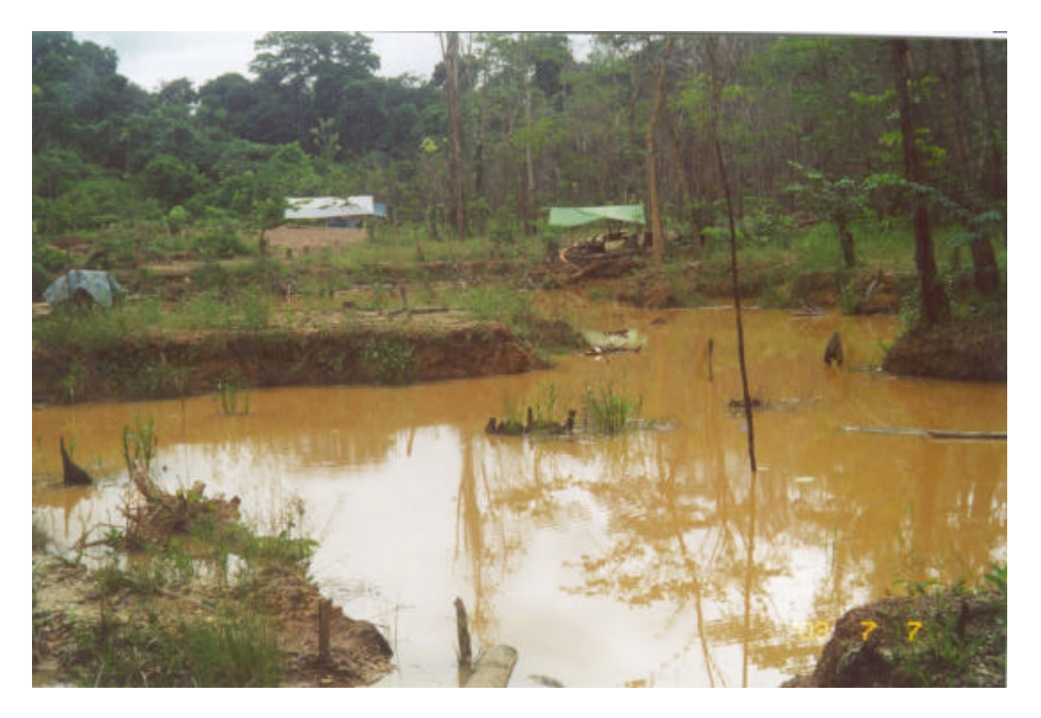
Photo 20 - Tailings Impoundment System Employed at 10 Miles, where Tailings is Routed Through Mined-Out Pit allowing Partially Settled Water to be Decanted to Nearby Stream.