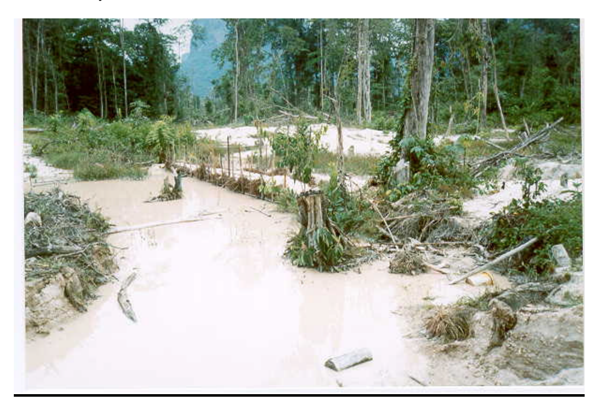
Photo 16 – Construction of Tailings Confinement Dam From Indigenous Material, as Part of a Closed Circuit System at Upper Takuba Creek.

Photo 15 – Tailings Confinement Dam as Part of The Closed Circuit Recycled Water System at Barlow.