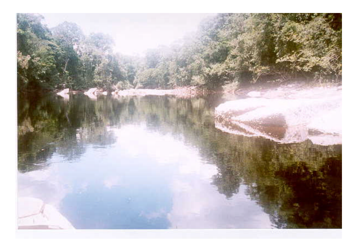
Photo 31 – Pristine Water of Previously Dredged Area, in the Vicinity of "Crapo Rock", Upper Kurupung River.