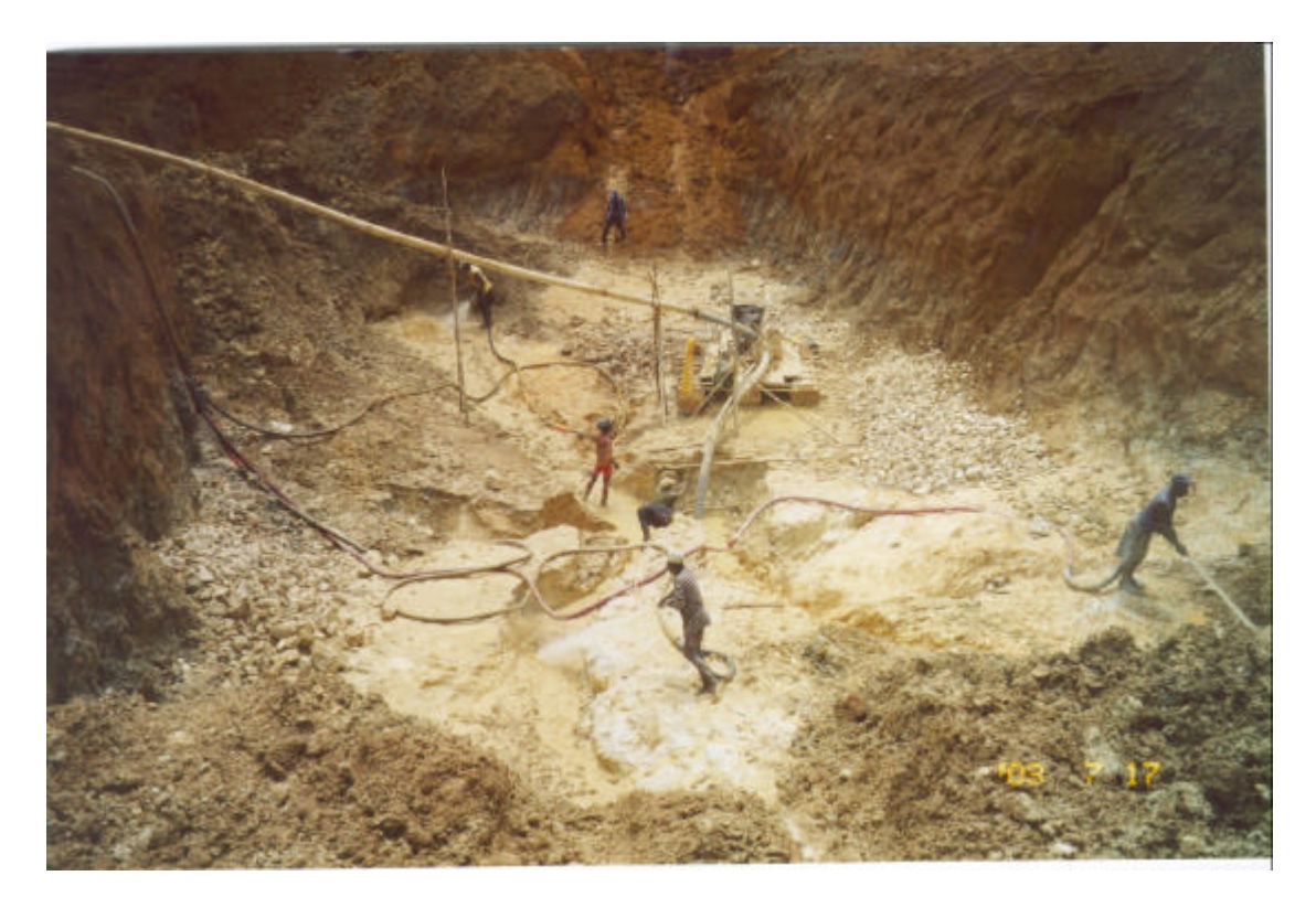
Photo 21 - The use of a Cat. Backhoe, at Five Star, that Resulted in Clean and Stable Pit Walls, and Jetting of Pay Material Only.