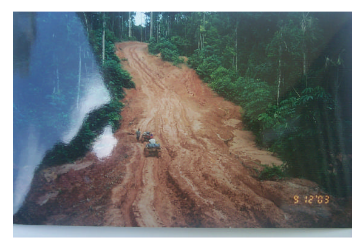
Photo 33 – Pink Hill or is "This Punishment Hill"? on route to Baramalli.