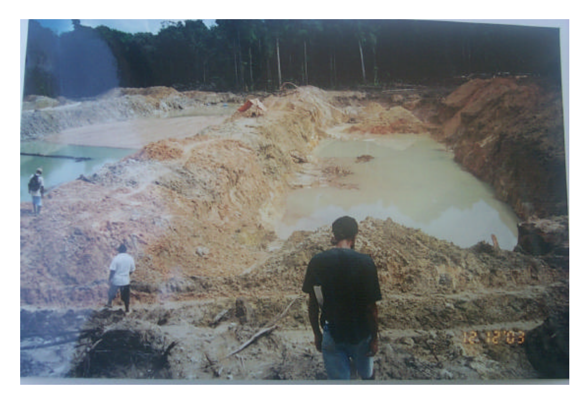
Photo 13 – Good pit configuration with, well-defined pit faces at Middle Aremu. Note, vertical pit faces (25 to 30ft.) deep with overburden overcastted close to the edge of the mining face.