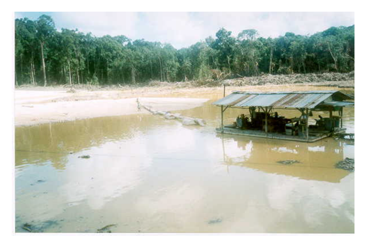
Photo 30 – Extended Discharge Pipeline, CMC's Operations, Olive Creek