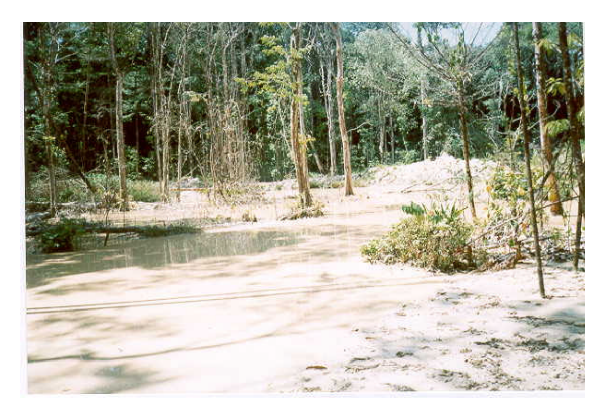
Photo 15 – Tailings Confinement Dam as Part of The Closed Circuit Recycled Water System at Barlow.