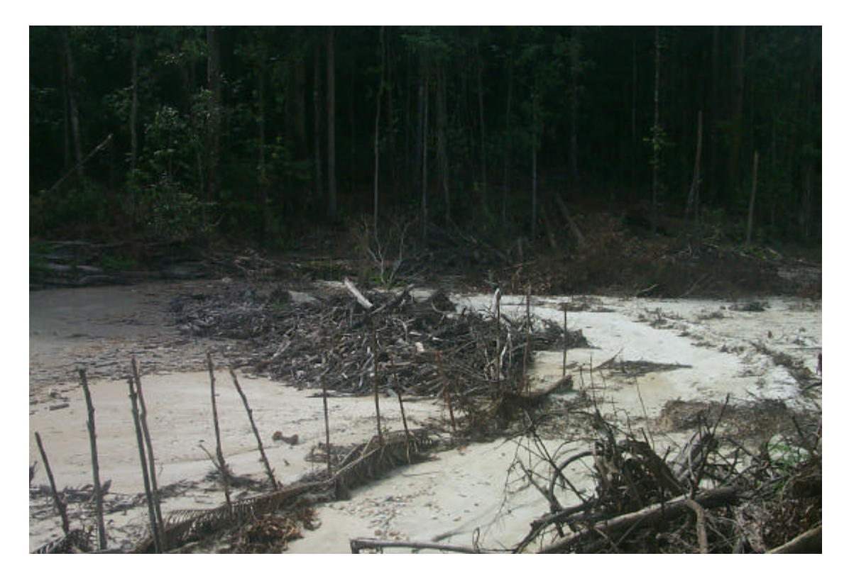
Photo 14 – Crude system of indigenous material used to confine tailings solids at Baramalli.

Photo 13 – Good pit configuration with, well-defined pit faces at Middle Aremu. Note, vertical pit faces (25 to 30ft.) deep with overburden overcastted close to the edge of the mining face.