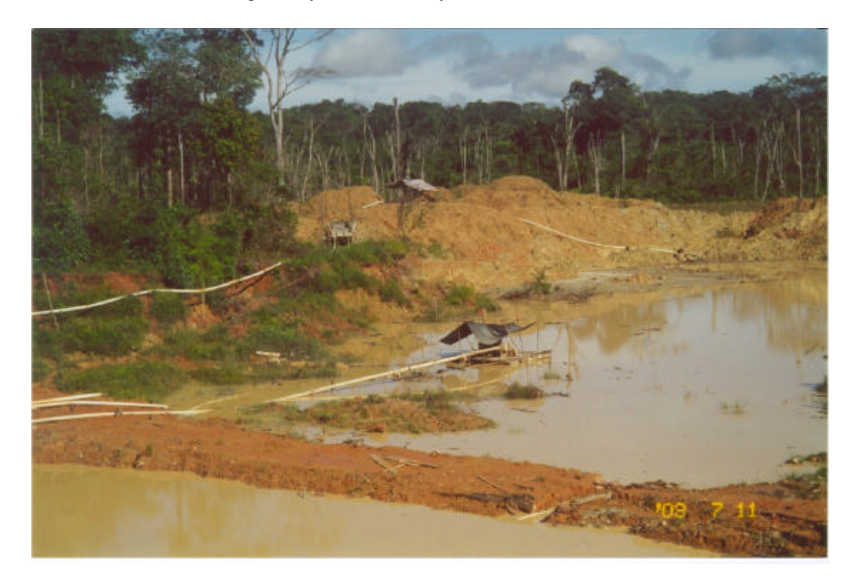
Photo 22 – Old Mined-out Pits Used to Establish Closed Circuit Recycle Water System at Arakaka

Photo 21 - The use of a Cat. Backhoe, at Five Star, that Resulted in Clean and Stable Pit Walls, and Jetting of Pay Material Only.