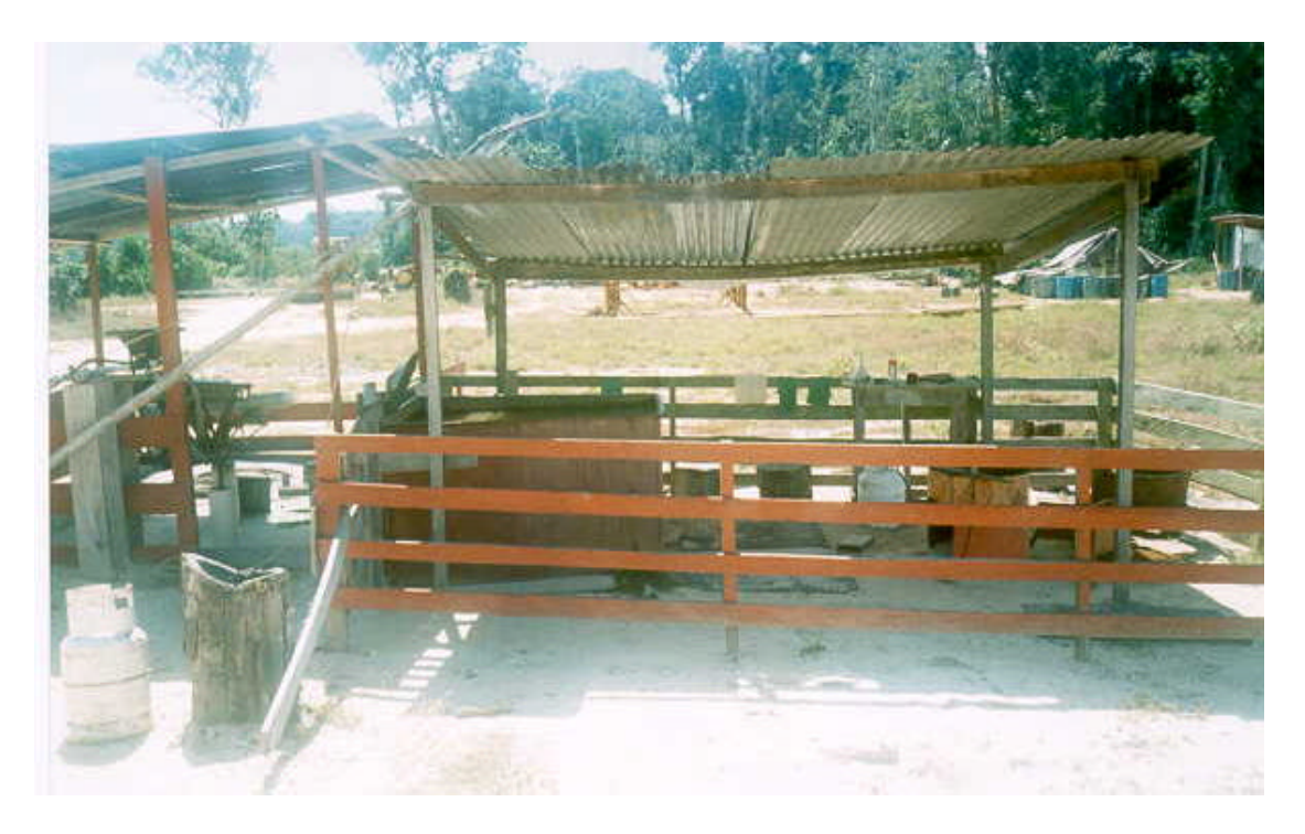
Photo 10 – Retorting Shed Consisting of Mercury Retort, Jig Box and Shaking Table for Proper Processing of Gold Amalgam and Black Sands at Olive Creek.