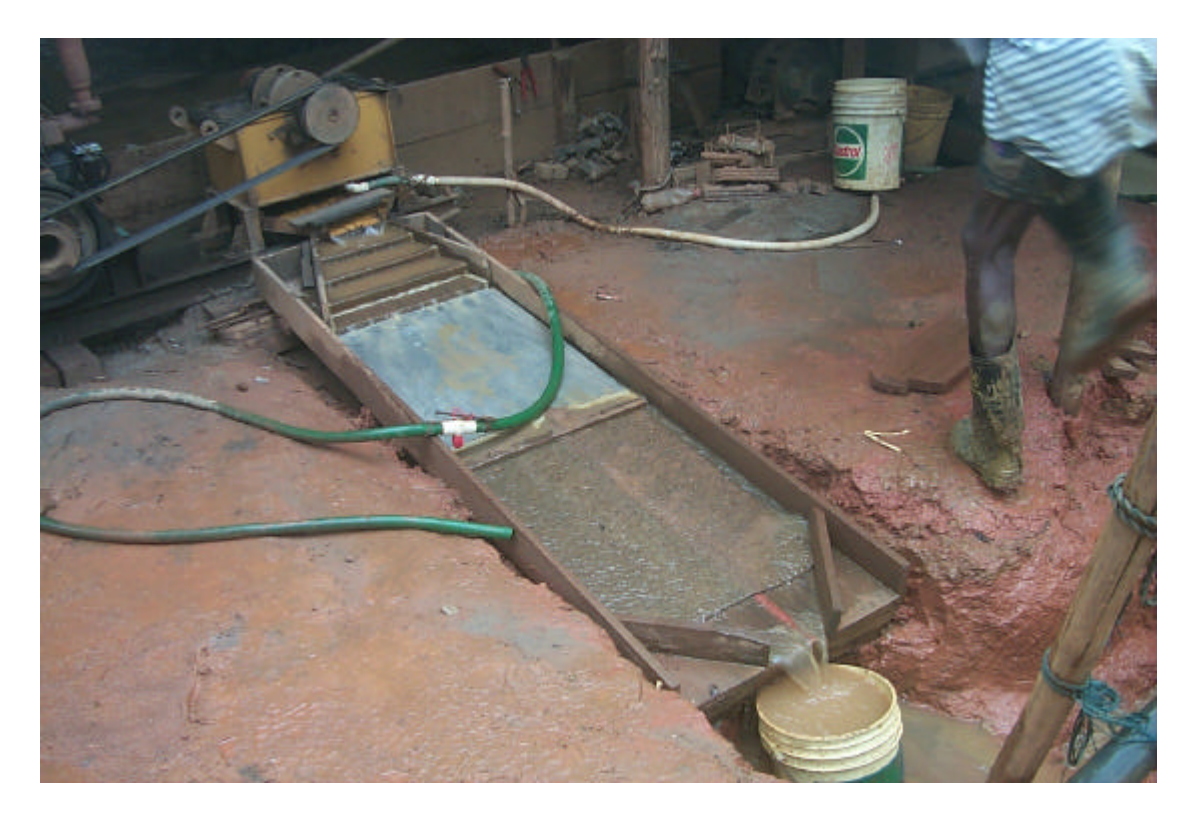
Photo 26 – Mercury Plate For Gold Amalgamation in Crusher Processing System at Eyelash. Note brown spots indicating loss of mercury.

Photo 25 – Large Mined-Out Area (Settling Pond) at Baramalli. Interest for use as an Aquaculture Farm.