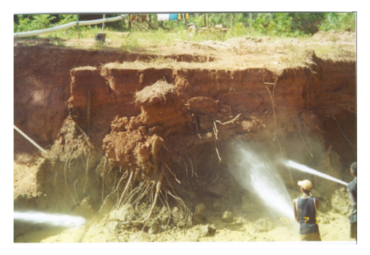
Photo 24 - A Typical Land Dredging Operation at Arakaka, where both Overburden and Pay Material are Removed by Jetting and Routed Through Sluice Box.

Photo 23 - A Small Cat. Dozer, at Five Star, Enabled Better and Safer Ground Preparation as well as some Land Reclamation.