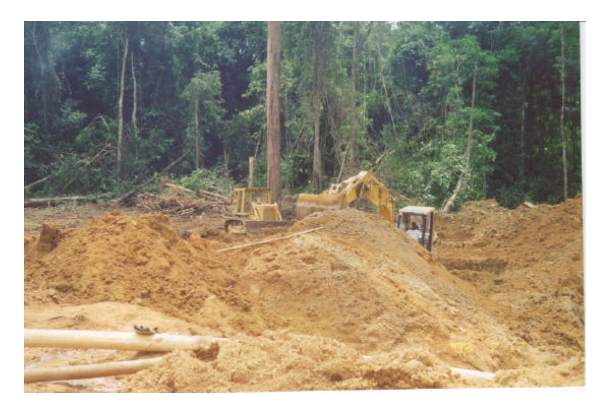
Photo 23 - A Small Cat. Dozer, at Five Star, Enabled Better and Safer Ground Preparation as well as some Land Reclamation.