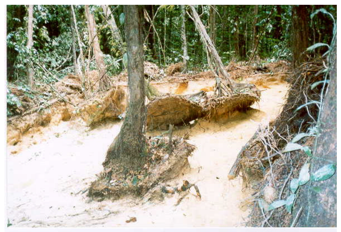
Photo 7 – Undermined Trees Left Standing in a Mined-Out Pit, at Chance Creek.