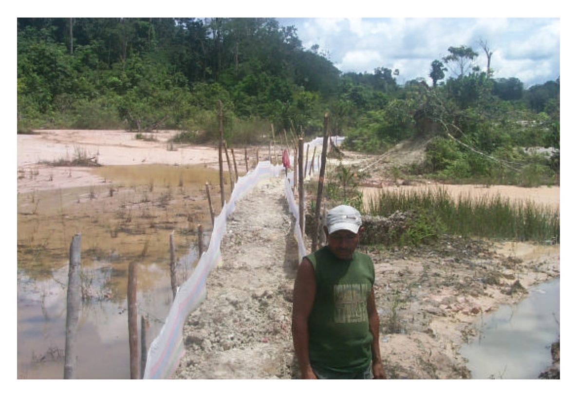
Photo 19 - GGMC's Experimental Dam - Local Filter Linings Pinned by Wooden Stakes