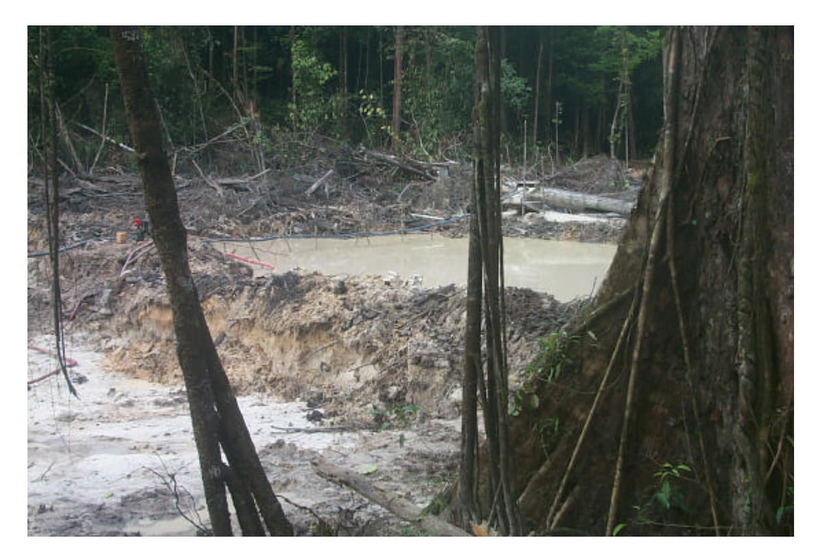
Photo 11 – A closed circuit recycled water system established at a hydraulicking operation at Baramalli.