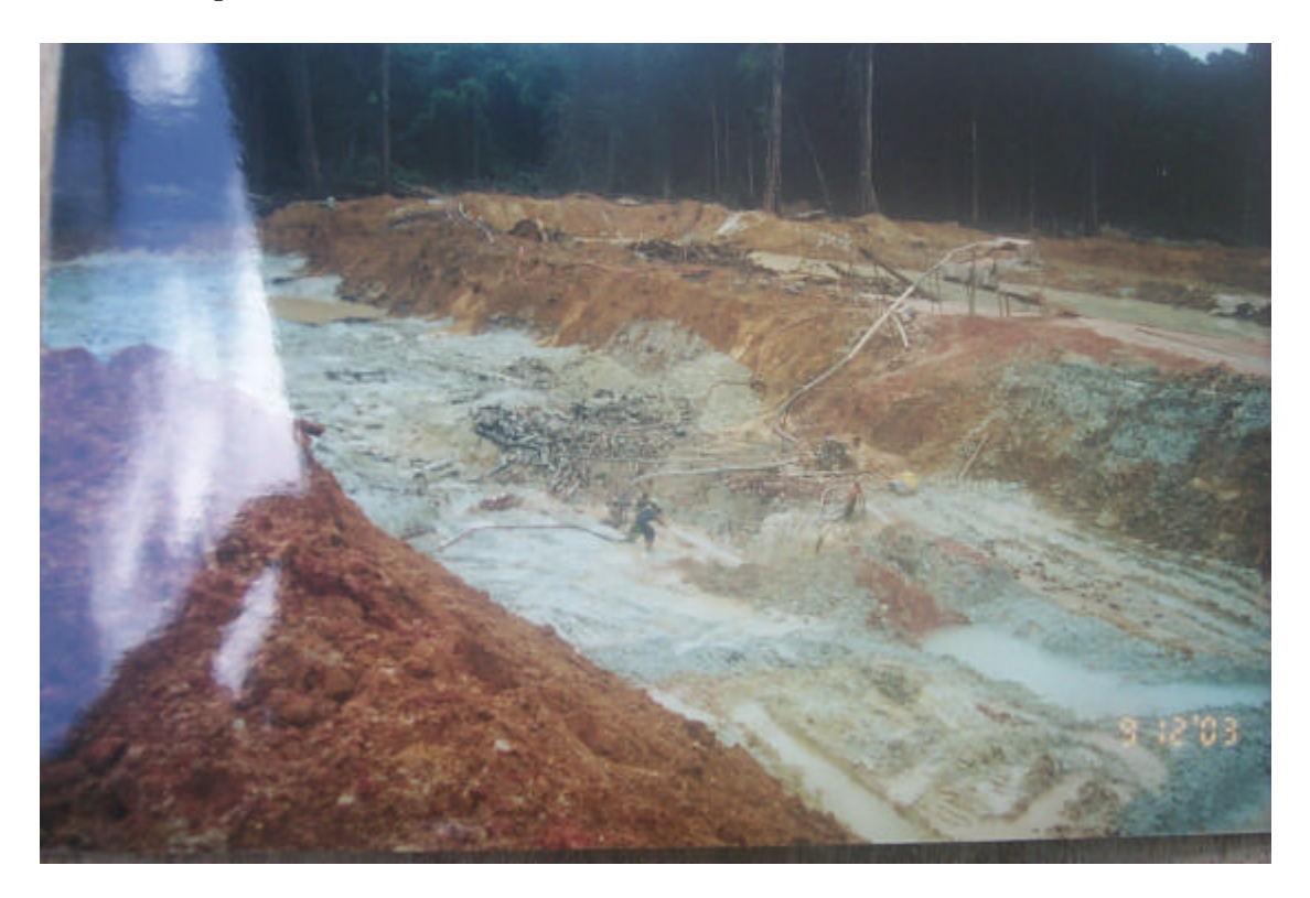
Photo 12 – An operation consisting of clean mining pit, good pit definition and mine configuration and a closed circuit recycle water system totally enclosed within an outer perimeter dam at Baramalli.