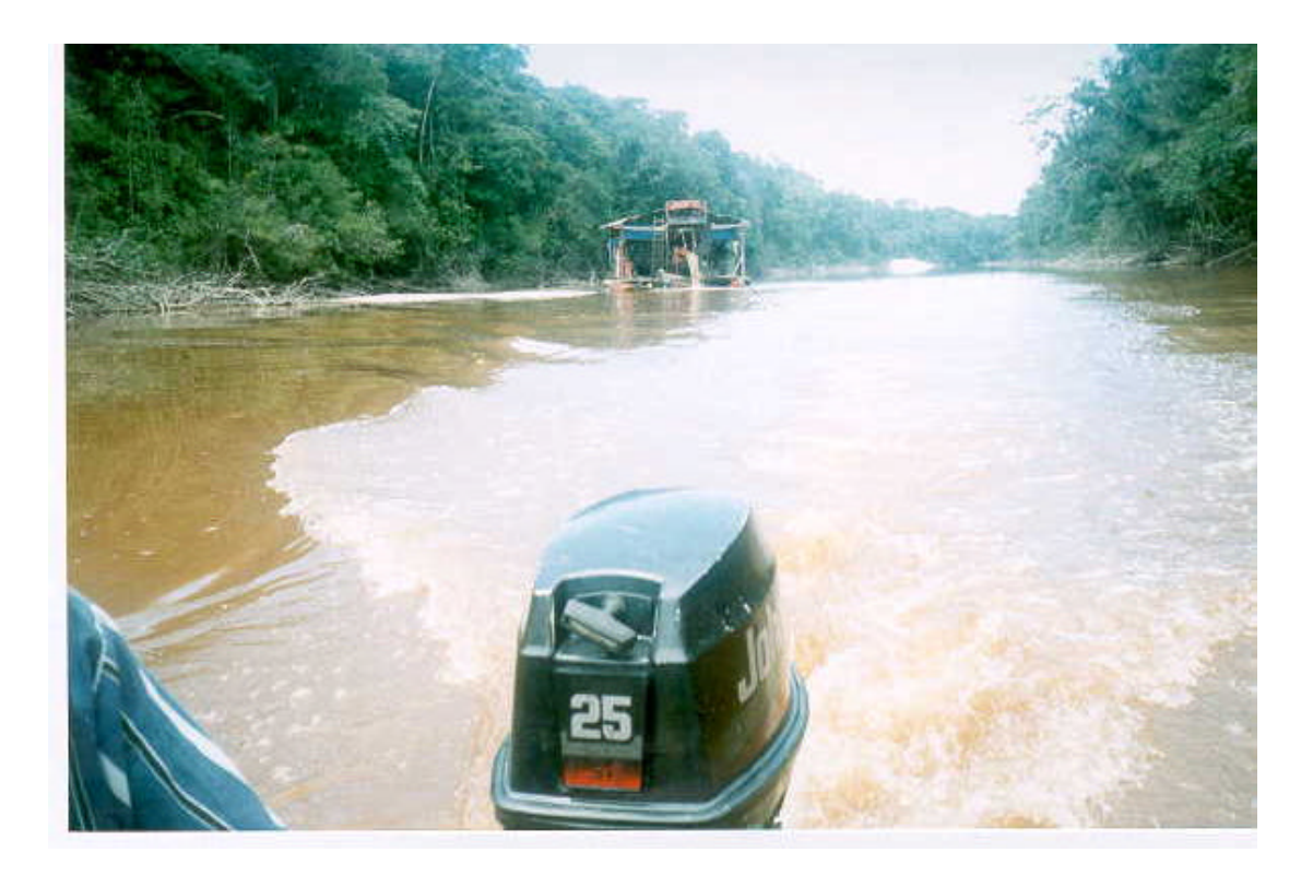
Photo 28 – Improper Positioning of River Dredge, with Tailings Discharge Angled Towards River Channel, Kurupung River.