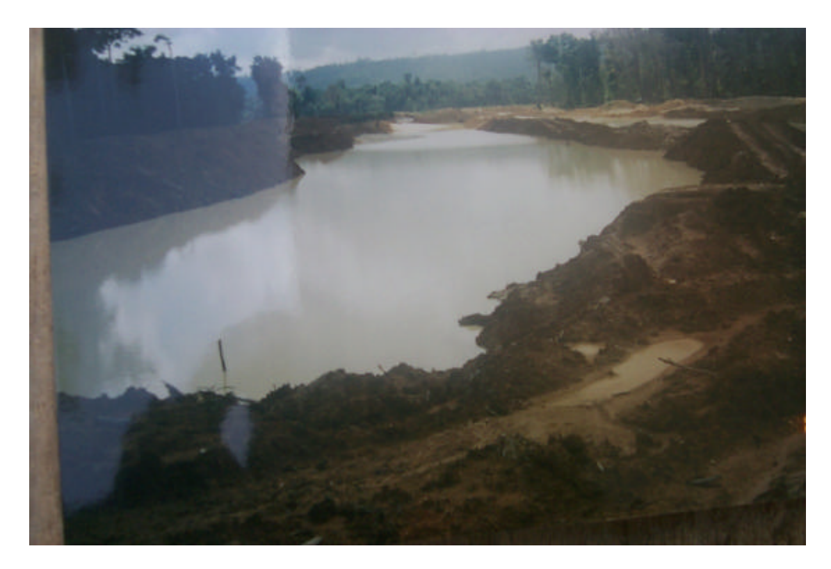
Photo 25 – Large Mined-Out Area (Settling Pond) at Baramalli. Interest for use as an Aquaculture Farm.