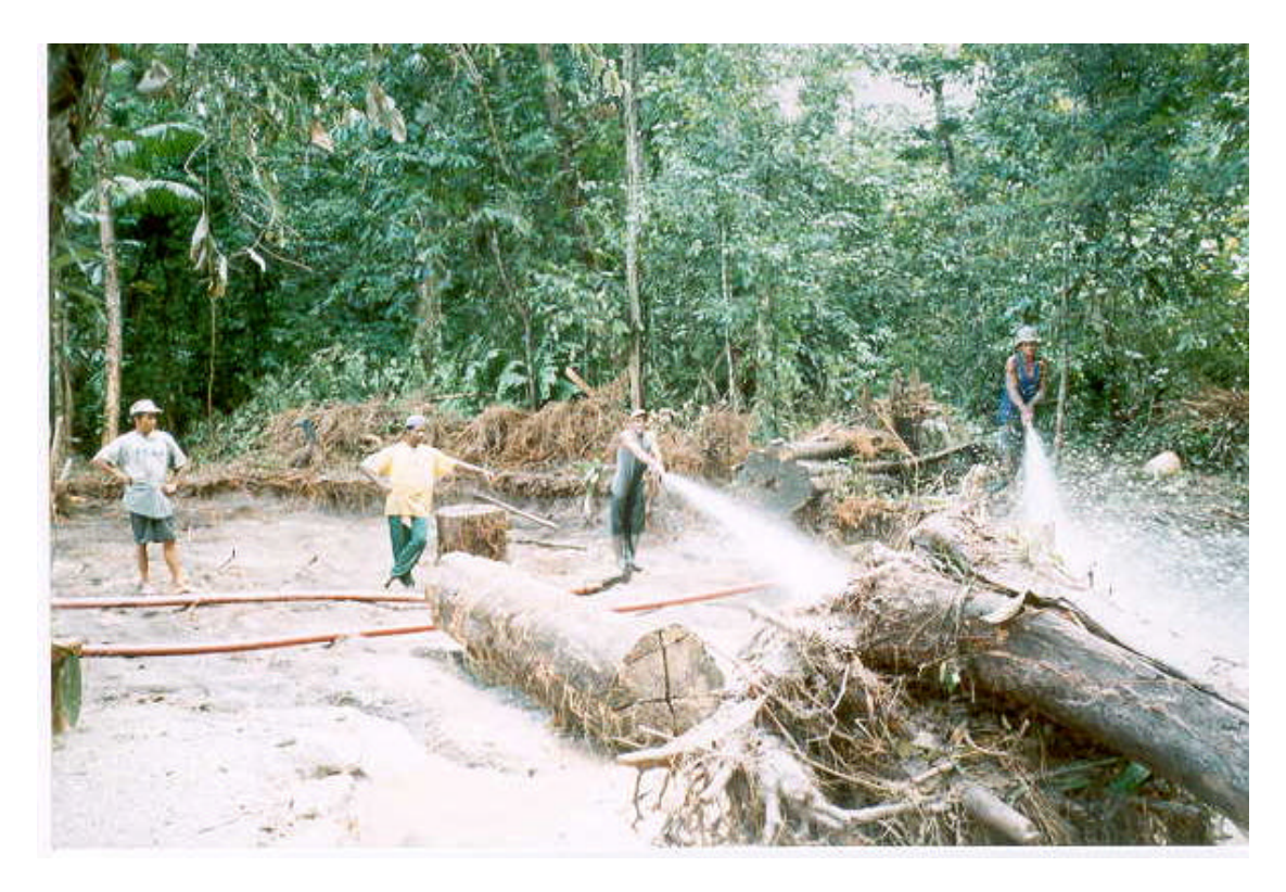
Photo 9 – A relatively Clean, Orderly and Shallow Mine Pit at Barlow.