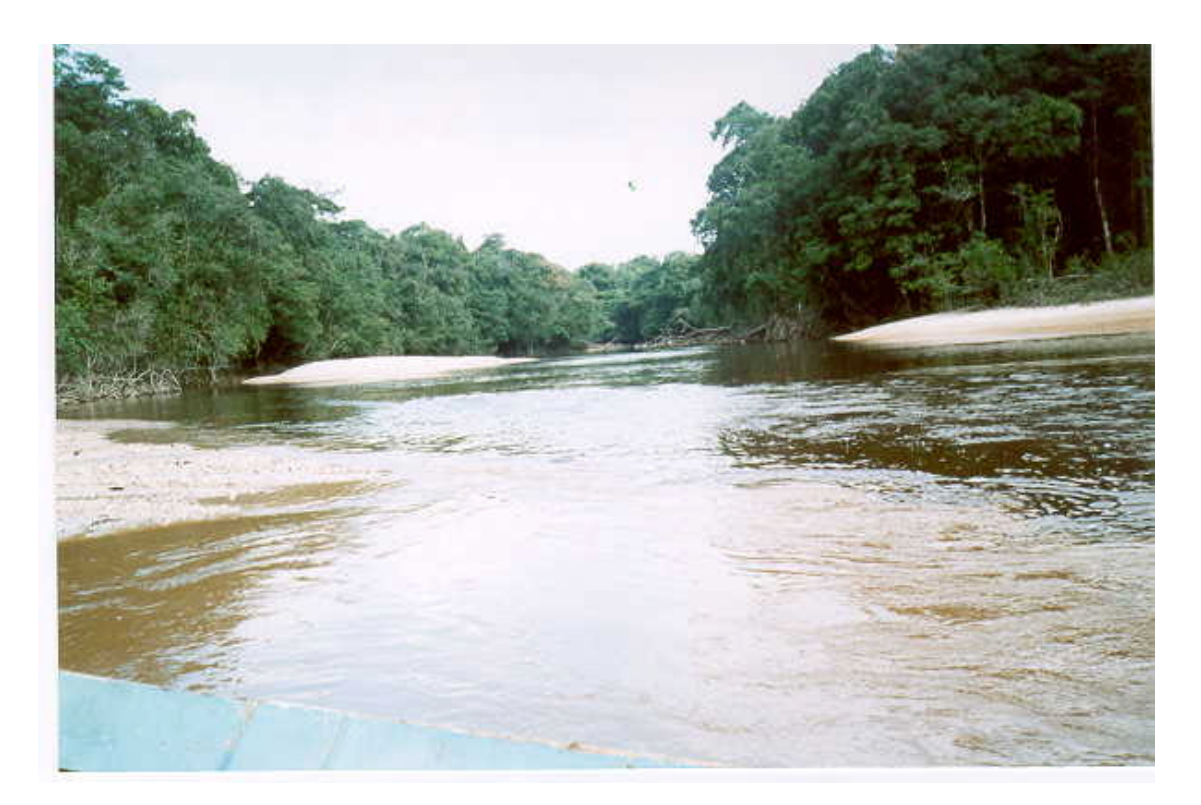
Photo 29 – Narrowing of River Channel by Tailings Solids from Previous River Dredging Operations. Kurupung River.