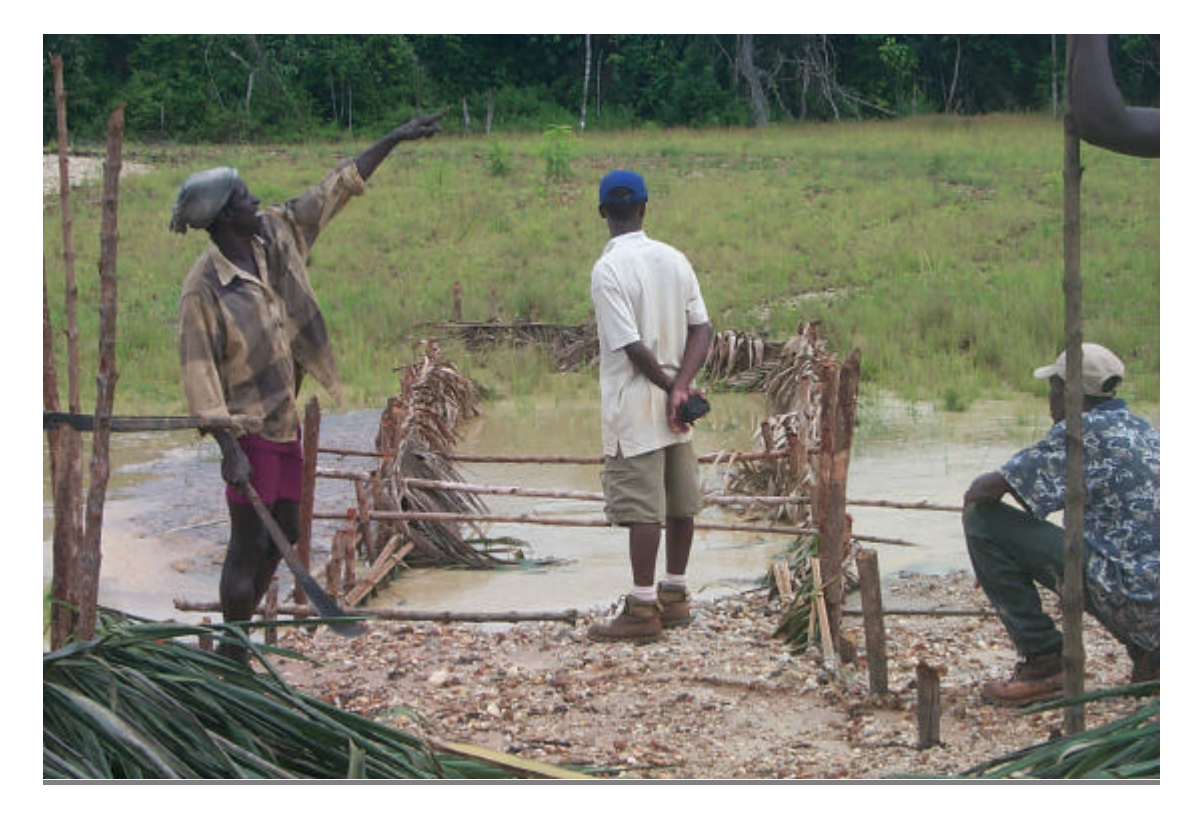
Photo 18 - Damming of Arakaka Creek by Confining Tailings Discharged Directly Between Two Rows of Plaited "Cocorite" Leaves Supported by Stakes.

Photo 17 – A Filtration Dam Constructed From Fibrous Roots and supported by Tree Trunks, as Part of a Closed-Circuit Recycled Water System at Upper Takuba Creek.