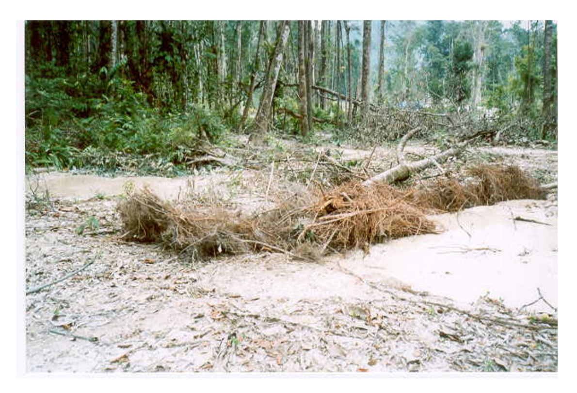
Photo 17 – A Filtration Dam Constructed From Fibrous Roots and supported by Tree Trunks, as Part of a Closed-Circuit Recycled Water System at Upper Takuba Creek.