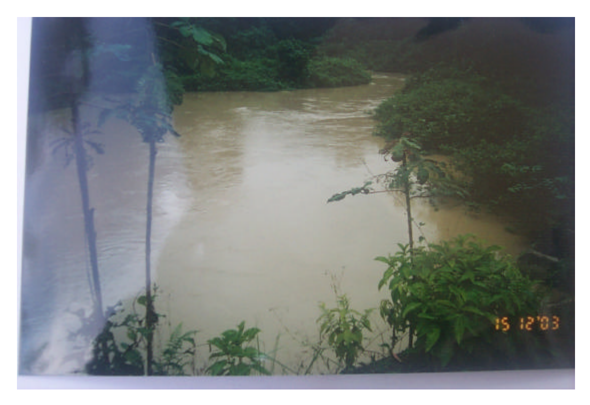
Photo 3 – Extremely turbid water of Aremu River, at bridge before GGMC's camp.