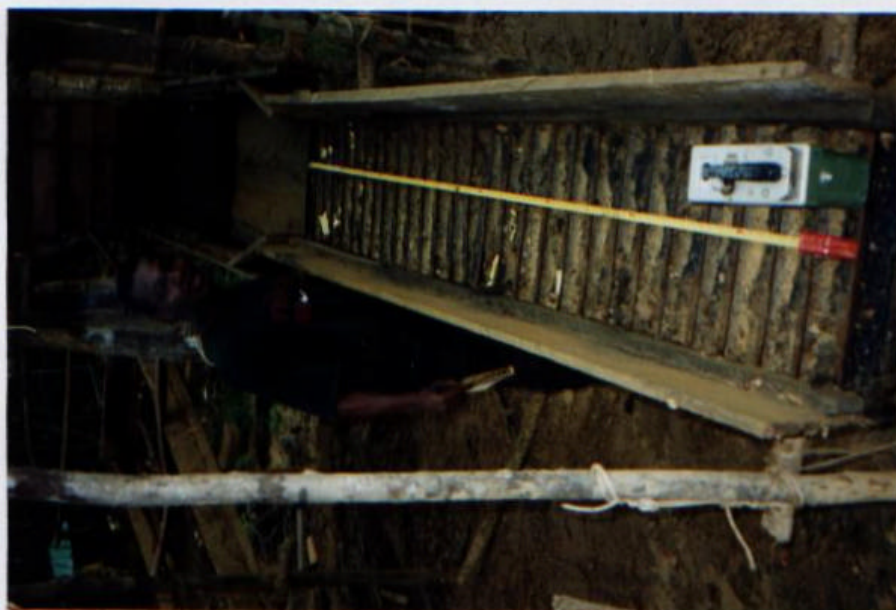
Photo 22 – Yellow Flagging Displays Recovered Radiotracers in Lower Section