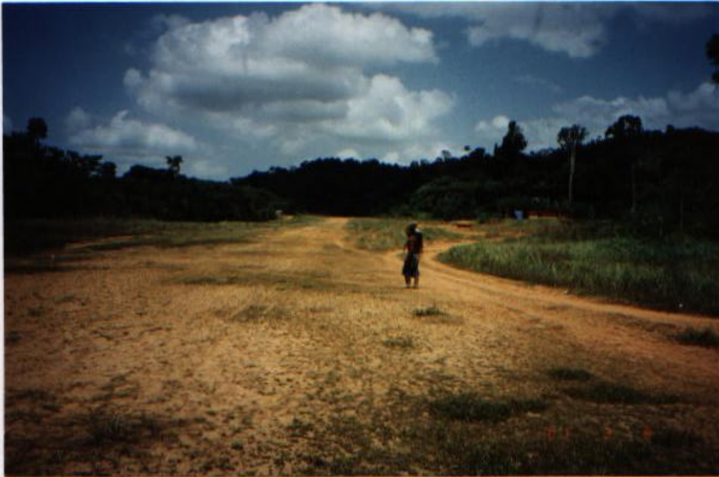
Photo 1 - Oko Airstrip