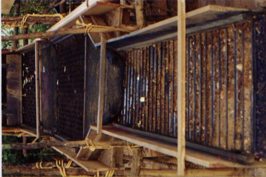
Photo 11 – Close-up of Expanded Metal and One-Inch Angle Iron Riffles at Sheriff's