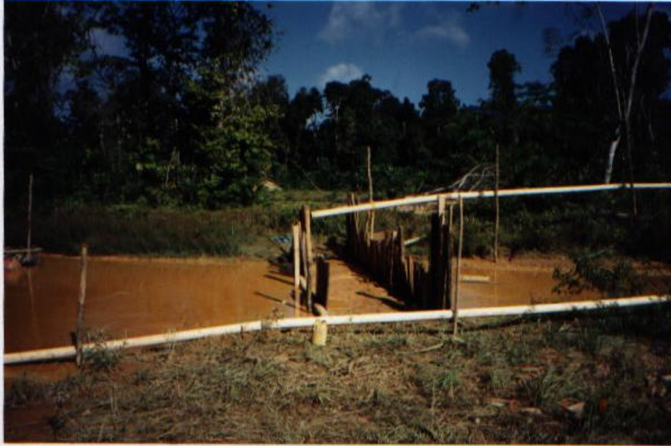
Photo 5 – Construction of a Diversion Dam by Manual Methods at Godtite's