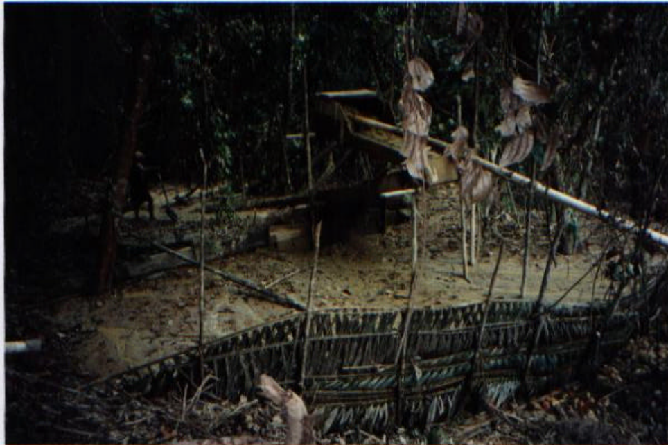
Photo 6 – Restraining Sluicelox Tailings with a Dam of Fronds at Gomes'