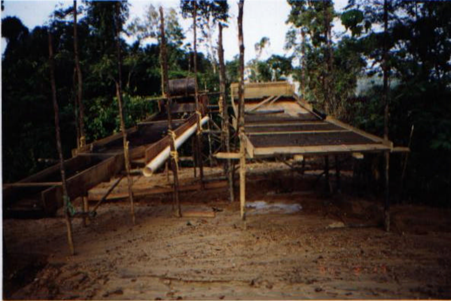
Photo 9 – The New (left) and Old (right) Sluiceboxes at Fazal Sheriff's