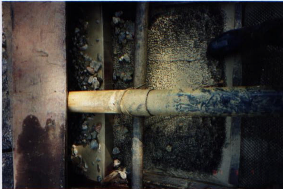
Photo 16 – Swollen and Hardened Unbacked Nomad Matting With No Expanded Metal Riffles